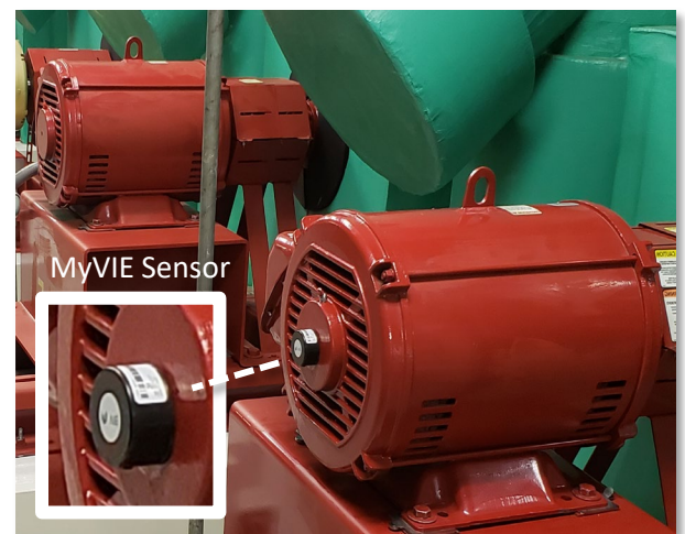
Emerson 30 HP Motor

During the baseline period, MyVIE found that the motor had above normal vibration levels with peaks contributed by VFD harmonics. Within a few months, vibration levels began to exceed 2g with intermittent peaks above 3g. During this time, maintenance personnel continued to perform visual inspection and did not report any unusual findings.